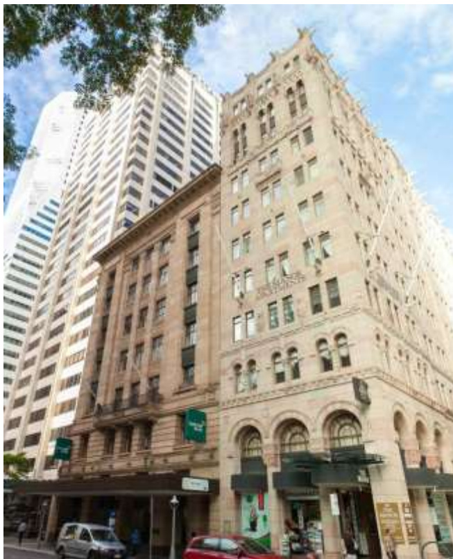
Our beautiful, heritage listed building in the central city

This handbook is designed to answer your questions about ABS and living in the beautiful city of Brisbane, but feel free to contact us if you have any questions or need assistance in any way. We look forward to meeting you!